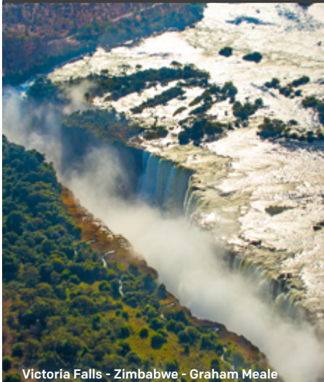
Victoria Falls - Zimbabwe - Graham Meale

Our extensions range from 3 to 5 days and are the perfect add-on to customise your holiday!