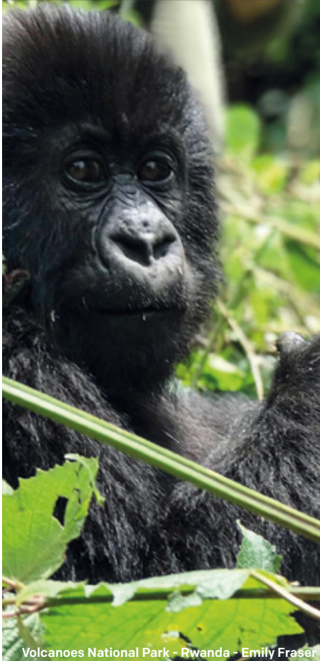
Volcanoes National Park - Rwanda - Emily Fraser

Want a shorter option? Our independent packages ensure you don't miss out on any experiences Africa has to offer. Visit our website for our complete range.